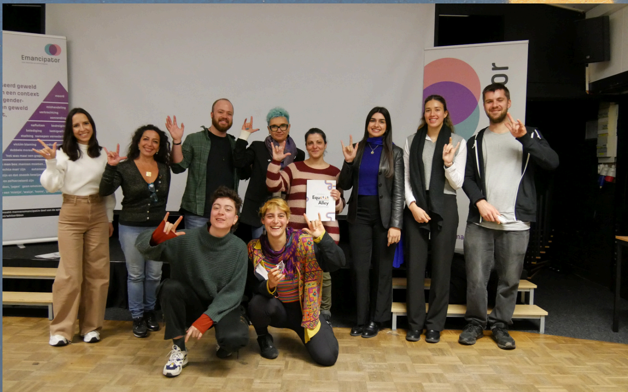
Project coordinator Partners